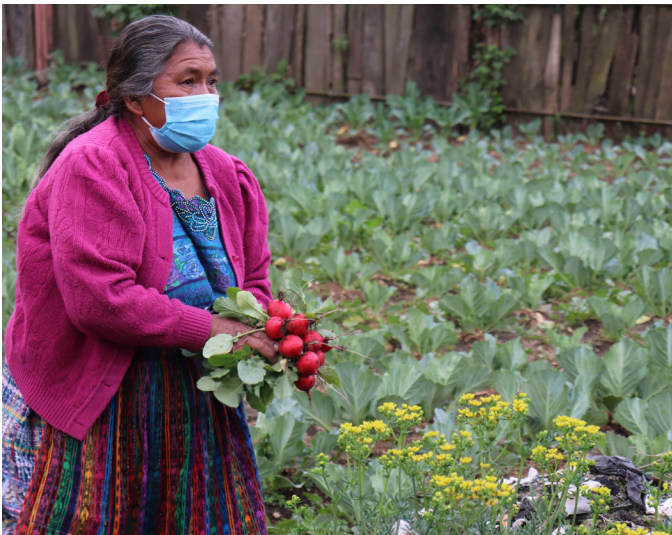
A woman in San Juan Ostuncalco harvests radishes for the seed project.