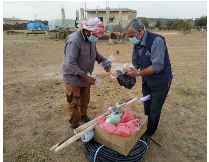
The MECC's Diakonia Department distributes seeds to farmers in Syria.